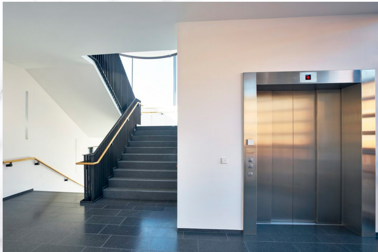
STAIRCASE AND LIFT